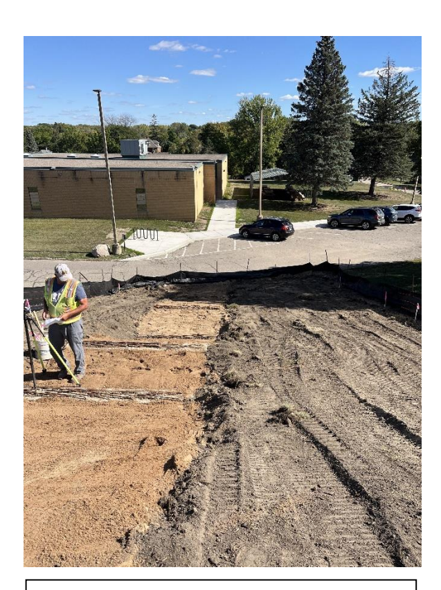
Concrete stairwell surveying and preparing for pouring of stairs