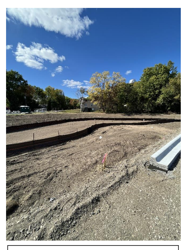
Retention basin subgrade complete along with drain tile installation