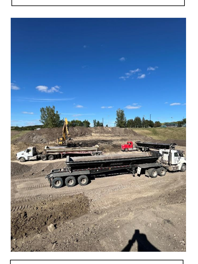
Excavation and exporting of unusable common soils underway