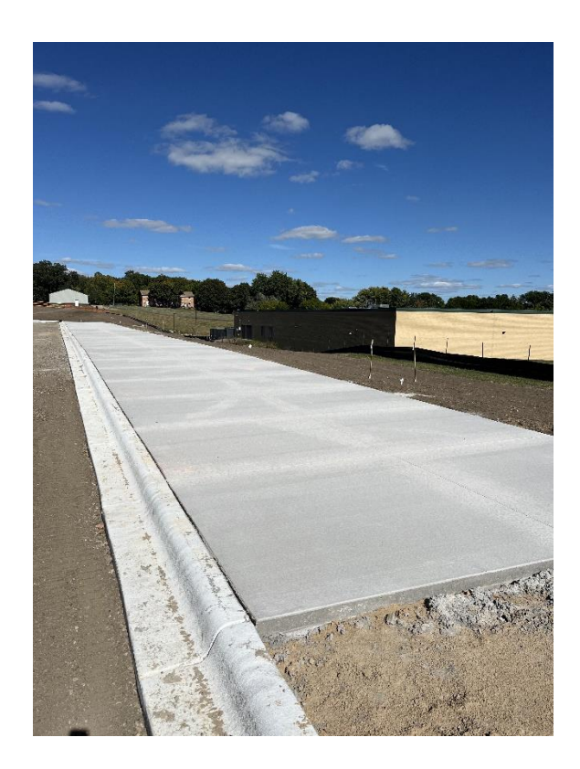
Concrete walk poured for bus drop-off area