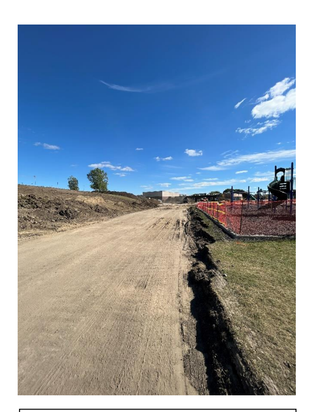
Removal of top soil complete at entry to new bus loop