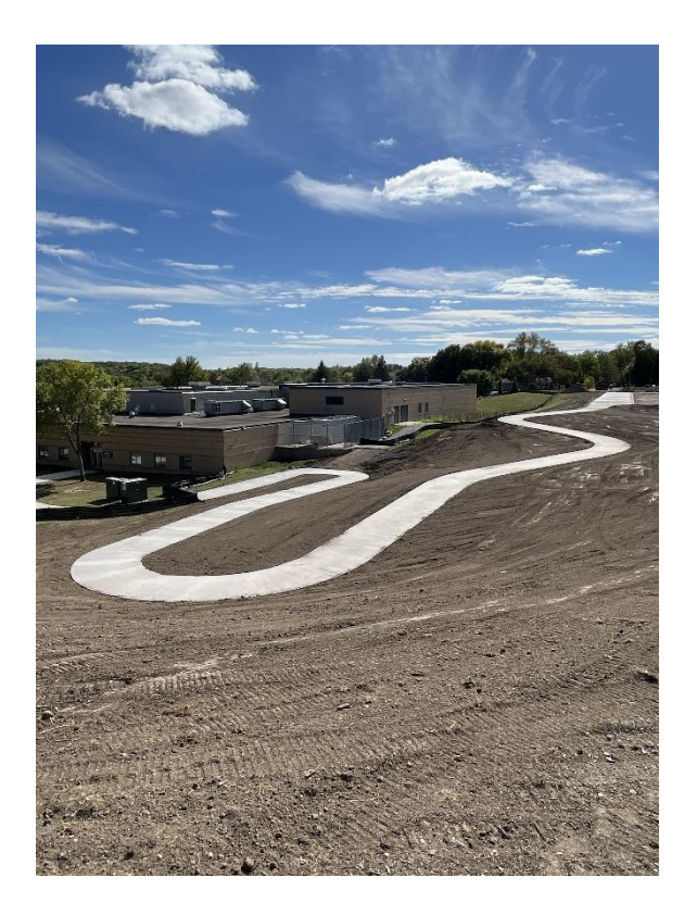
Entirety of ADA concrete path complete and remainder of site brought to finish grade