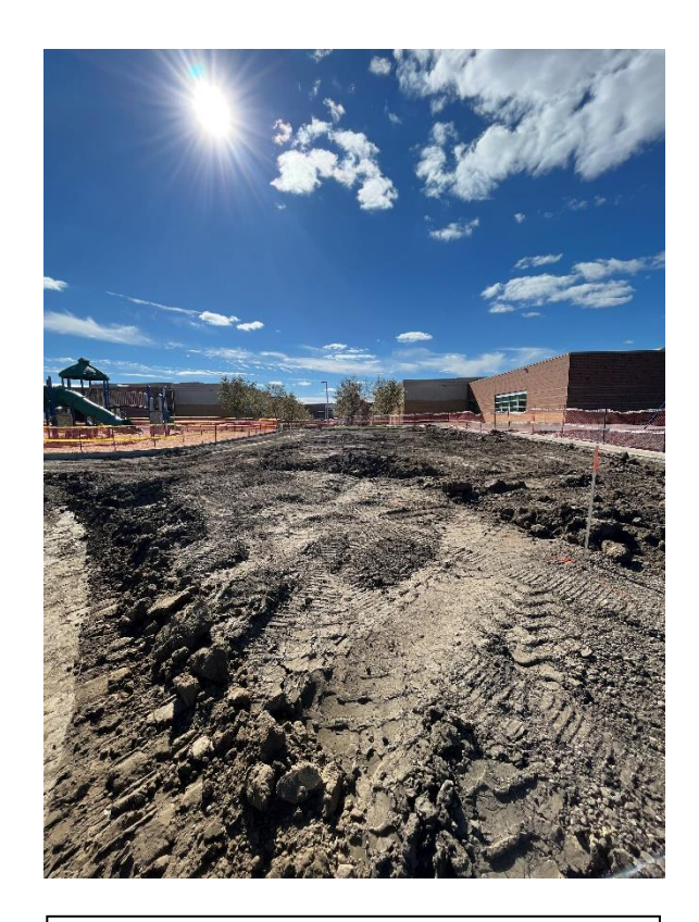
Removal of old asphalt complete between playgrounds