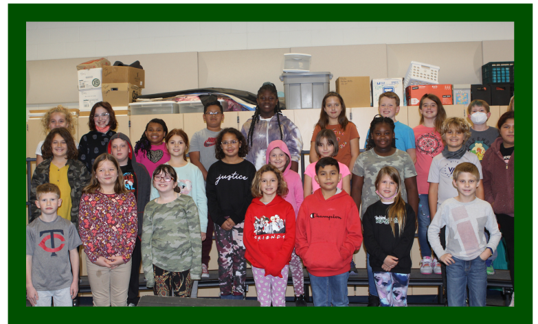
Members of the Choir Arts Troupe

A few other arts troupes offered this year include Intro to dance classes, Intro to Theater Games, Reader's Theater (putting on a short play), Gullah Stick Pounding and World Drumming, to name just a few.